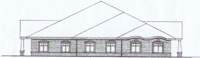
NORTH ELEVATIONS SCALE 1/8"=1'-0"

Mid States Development, Inc. 475 Chippewa Mall Dr., Ste 335 Chippewa Falls, WI 54729 715-723-2223